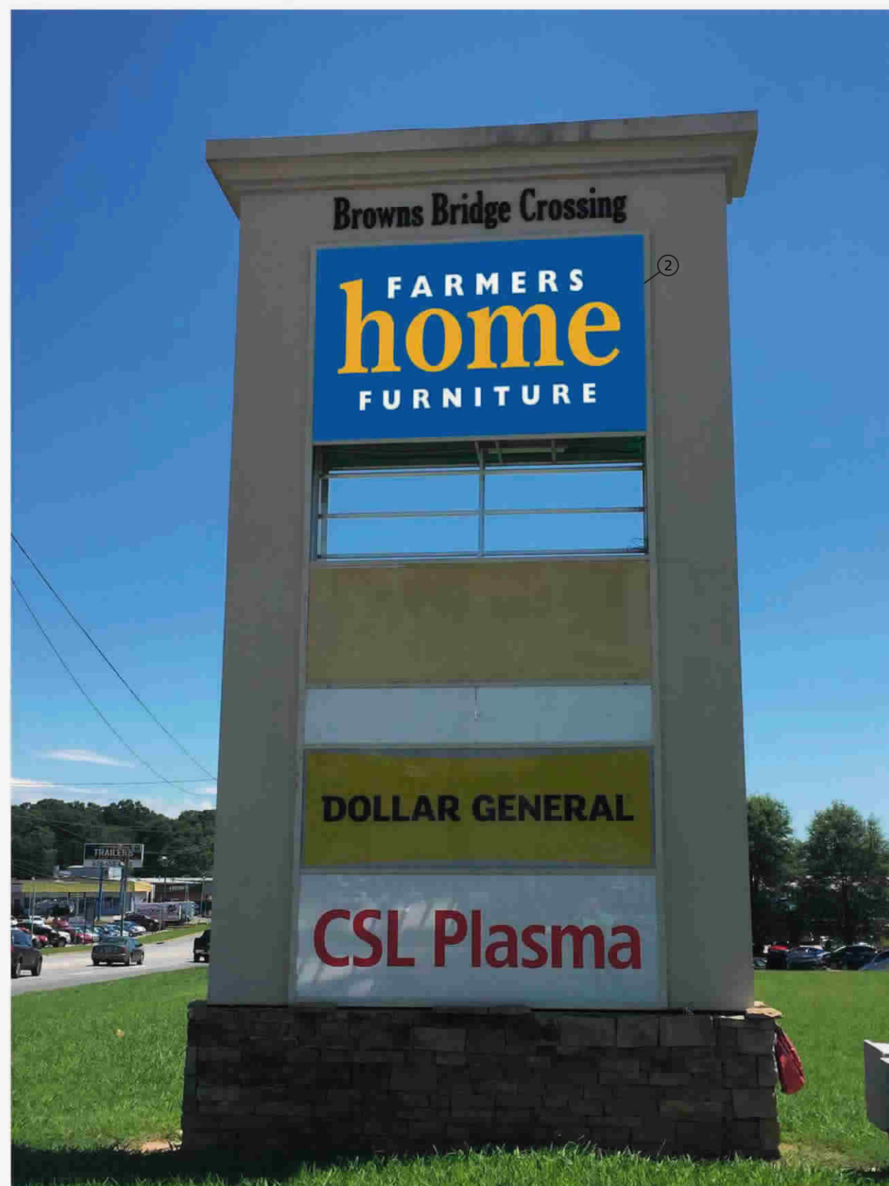
Pylon panel: 97 5/8" x 59 1/2"

GAINESVILLE, GA 2275 Browns Bridge Rd. 30501