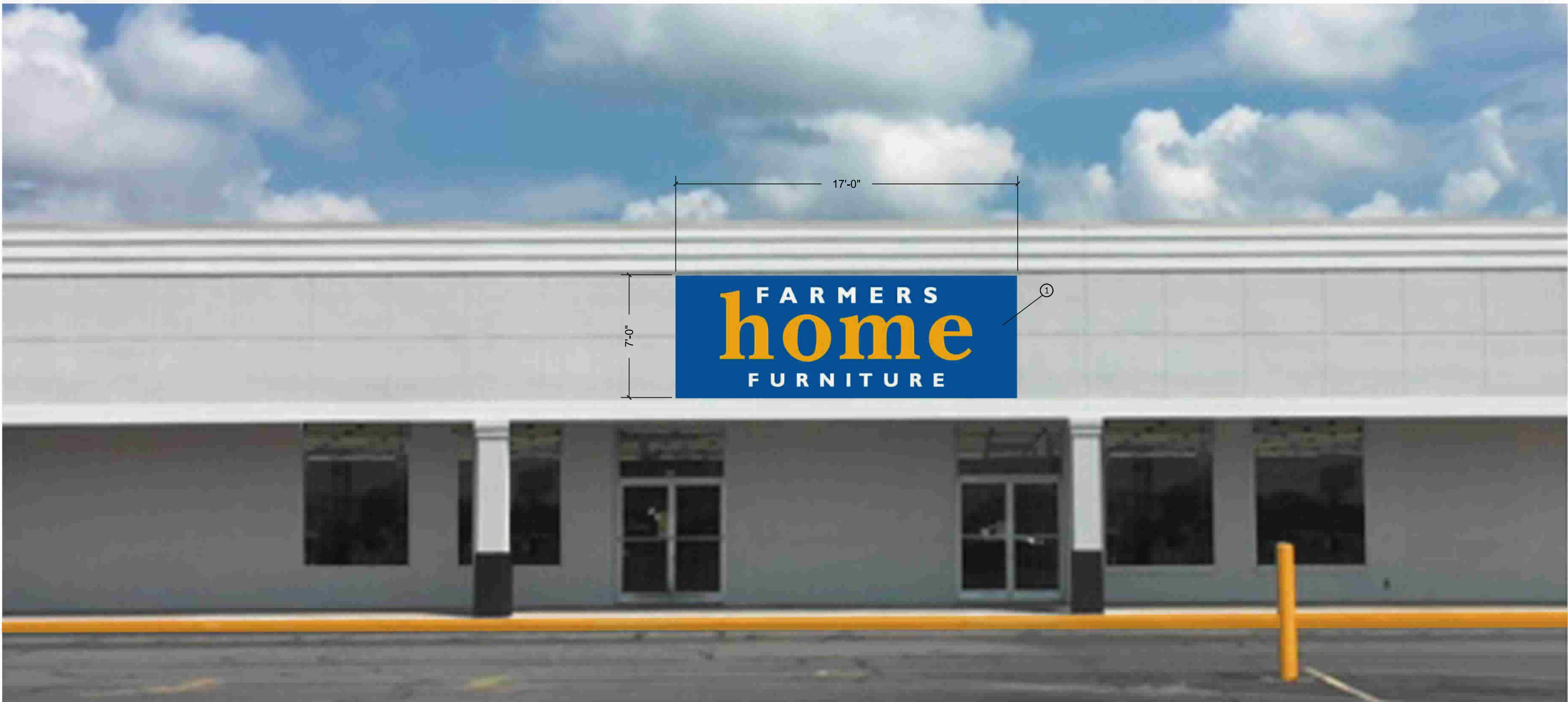
FARMERS HOME FURNITURE 7' HIGH X 17' WIDE STORE FRONT SIGN