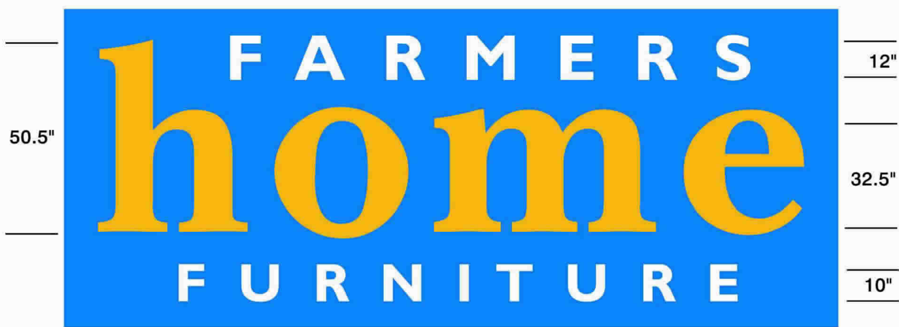
FARMERS HOME FURNITURE 7' HIGH X 17' WIDE STORE FRONT SIGN

UL listed / LED lighted / channel letters: LED lighting - Agilight Pro 115 white (double rows in vertical strokes of Home) Plastic faces - 3/16" acrylic: Farmers Furniture - white / Home - 2016 yellow Trim-cap - Farmers Furniture - 3/4" white / Home - 1" Gemini 2540 Mango yellow Returns - .040 white inside: Farmers Furniture - 3.5" white / Home - 4.5" yellow to match 2016 yellow acrylic Backs - white 1/8 poly-metal Power supply - Agilight Slim 60w / 12v - mounted inside "h" of Home AC Disconnect switch - left side of "h" of Home Photo Cell - Left side of "h" of Home UL polycarbonate cover - covers all AC power components inside "m" of Home to meet UL requirements