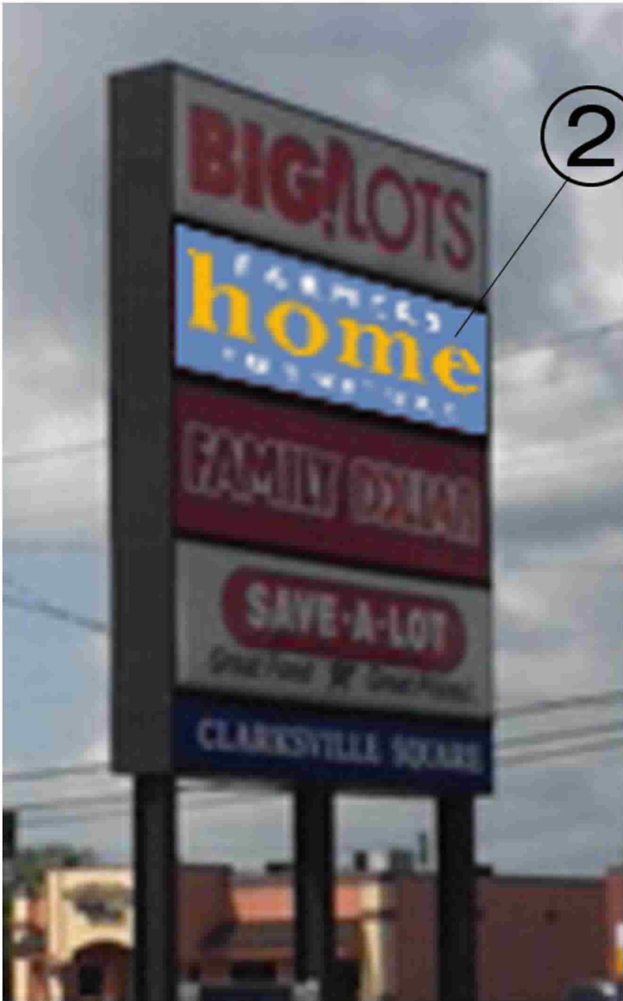
FARMERS HOME FURNITURE 7' HIGH X 17' WIDE STORE FRONT SIGN