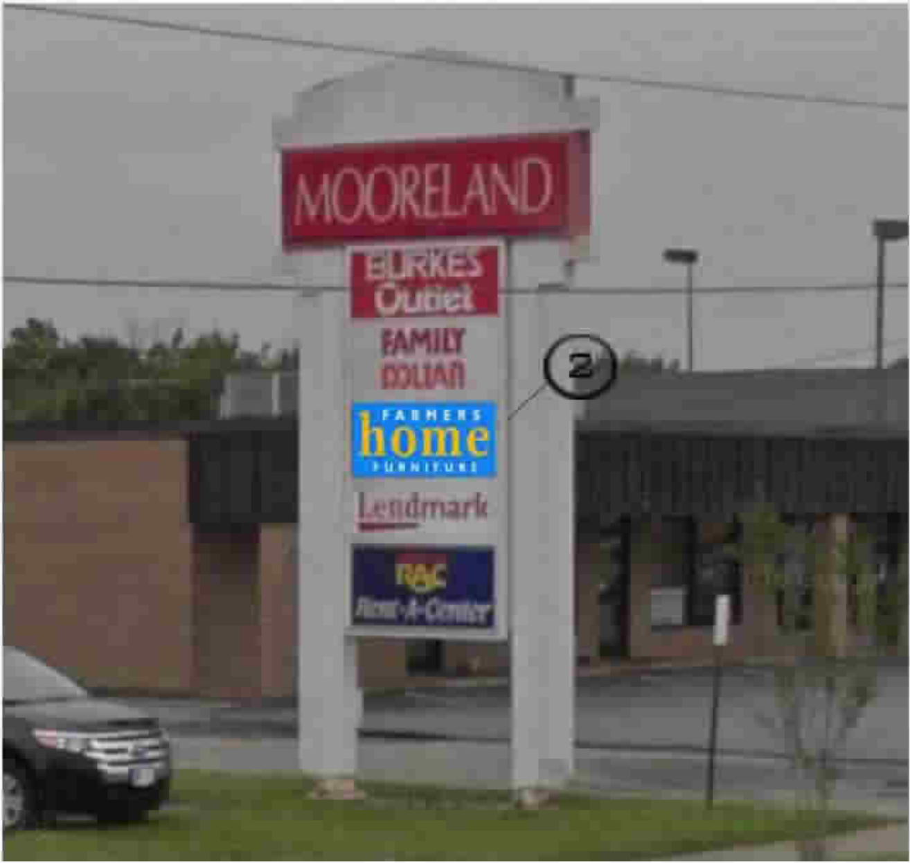
FARMERS HOME FURNITURE 7' HIGH X 17' WIDE STORE FRONT SIGN