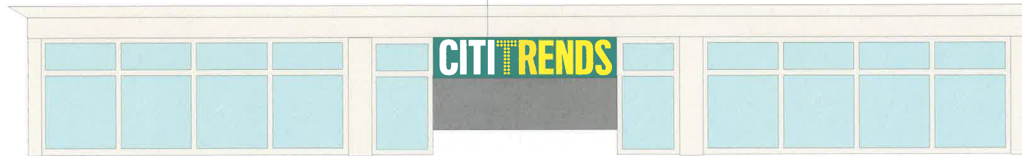
Citi Trends space 72' wide

Sign sized to fill space above door - 3' x 13' 11 5/8" 30" LED lighted channel letters on a 3' x 13.5' powder-coated aluminum back-panel